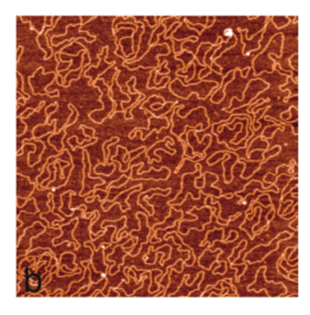
Figure 2: Concentrated "solution" of circular DNA.

Examples will be presented for linear DNA of various lengths, circular DNA as isolated molecules and in concentrated forms, and knotted DNA. For these studies, Atomic Force Microscopy (AFM) images of DNA were analyzed and interpreted using polymer physics concepts. It turns out that AFM images deliver a wealth of detailed data never available before and that now it is possible to compare theoretical predictions for linear, circular and knotted polymers with real polymers.